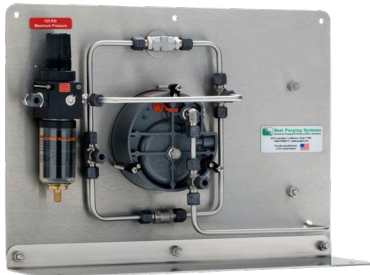
Horizontal Mount Unit with Pressure Switch