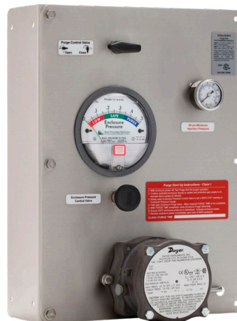
Vertical Mount Unit with Pressure Switch for left or right side mounting