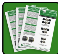
Model BCK Unit & Bulkhead Connection Kits Connects the unit and multiple protected enclosures of an array