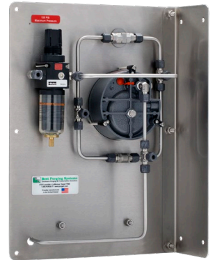
Vertical Mount Unit with Pressure Switch