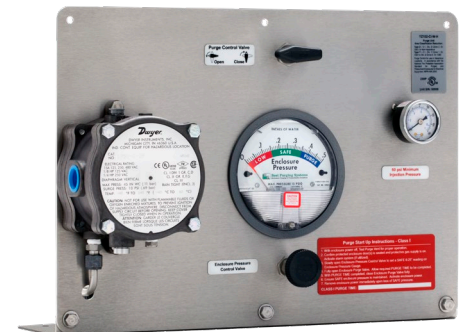
Horizontal Mount Unit with Pressure Switch for top or bottom side mounting