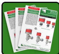
Model PV Spark Arresting Pressure Vents Prevents excessive enclosure pressure upon unit regulator failure