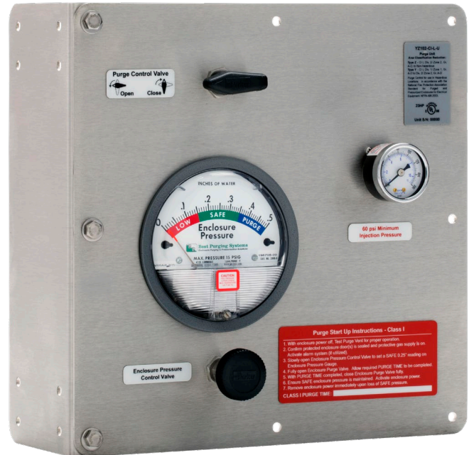
Universal Mount Unit less Pressure Switch for any side or panel mounting