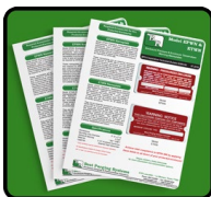
Model EPWN & ETWN Pressure & Temperature Warning Nameplates Provides NFPA required markings for protected enclosure doors and covers