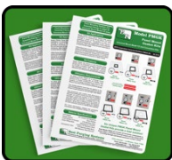
Model PMGK Panel Mount Gasket Kits Converts universal mount units for panel mounting in protected enclosures

One (1) Model EPWN Enclosure Warning Nameplate & One (1) Unit Flange or Panel Mount Fastener Kit furnished with all Units. All specifications subject to change without notice. Warranty & Liability policies available upon request.