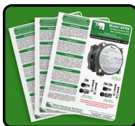
Model EPSK Enclosure Pressure Switch Kits Complements universal mount units to activate audible or visual alarms