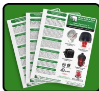
Model RAB & RAH Remote Alarm Beacons & Horns Signals loss of protected enclosure safe pressure