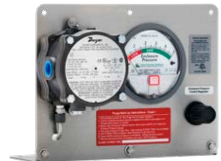
Horizontal Mount Unit with Pressure Switch for top or bottom side mounting