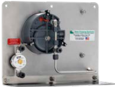
Horizontal Mount Unit with Pressure Switch

Enclosure Pressure Reference Connection Enclosure Pressure Gauge Atmospheric Reference