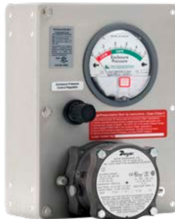
Vertical Mount Unit with Pressure Switch for left or right side mounting