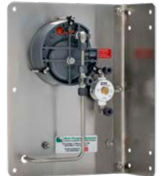
Vertical Mount Unit with Pressure Switch

Unit Supply Connection Enclosure Pressure Control Regulator Enclosure Supply Connection