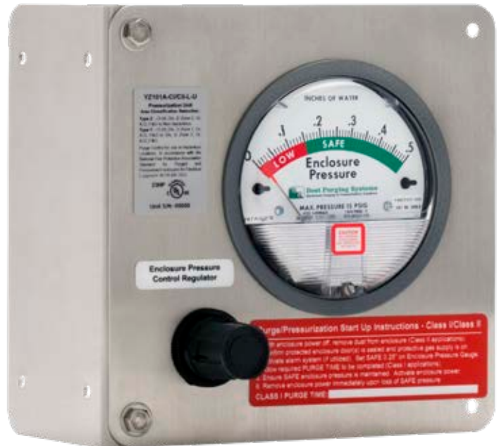
Universal Mount Unit less Pressure Switch for any side or panel mounting