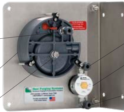
Universal Mount Unit less Pressure Switch

Enclosure Pressure Reference Connection Enclosure Pressure Gauge Atmospheric Reference