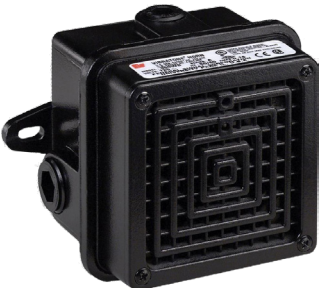
Model RAH-2-S-C ALARM HORN