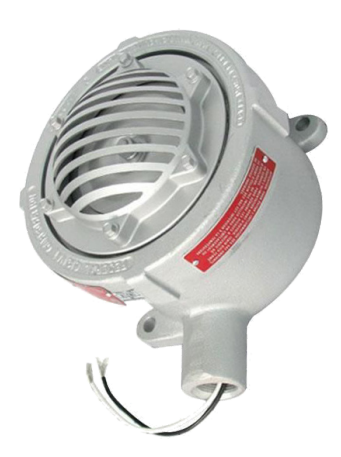
Model RAH-1-P-C ALARM HORN