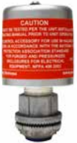
PV - 2 - T