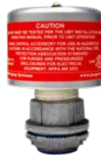
PV - 3 - T