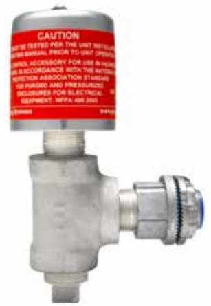
PV - 2 - S