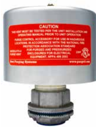
PV - 4 - T