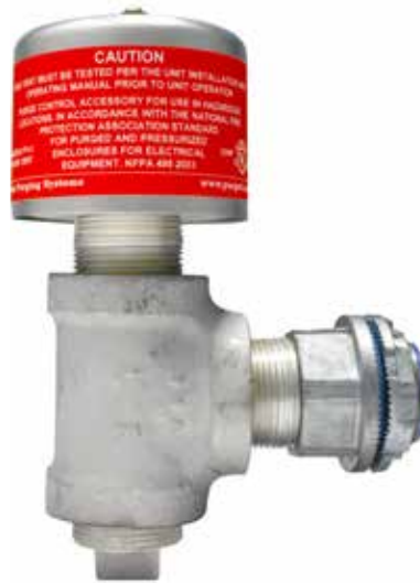
PV - 3 - S