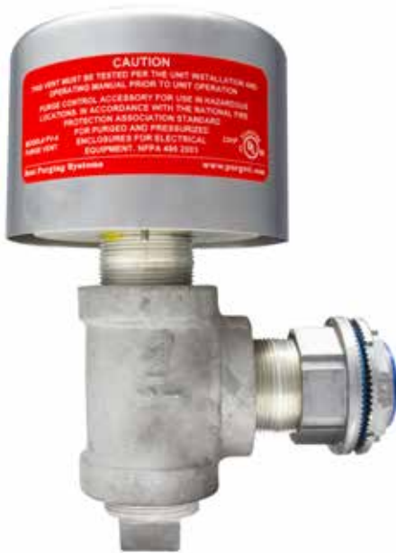
PV - 4 - S

All Model PV Purge Vents MUST be installed in a true vertical position for proper operation and are available in "T" (top mount) and "S" (side mount) configurations. The vents feature a conduit hub with sealing gasket to connect easily to a protected enclosure, or may be mounted remotely. - please contact factory for more details