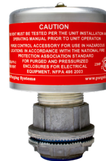
PV - 3 - T