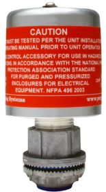
PV - 2 - T