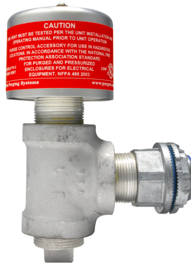
PV - 3 - S