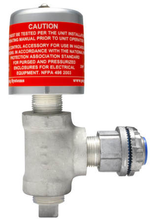
PV - 2 - S