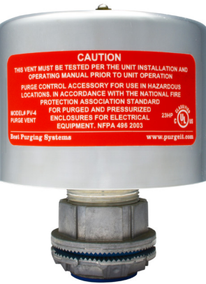
PV - 4 - T

All Model PV Purge Vents MUST be installed in a true vertical position for proper operation and are available in "T" (top mount) and "S" (side mount) configurations. The vents feature a conduit hub with sealing gasket to connect easily to a protected enclosure, or may be mounted remotely. - please contact factory for more details