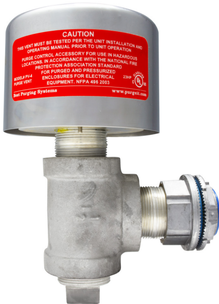
PV - 4 - S